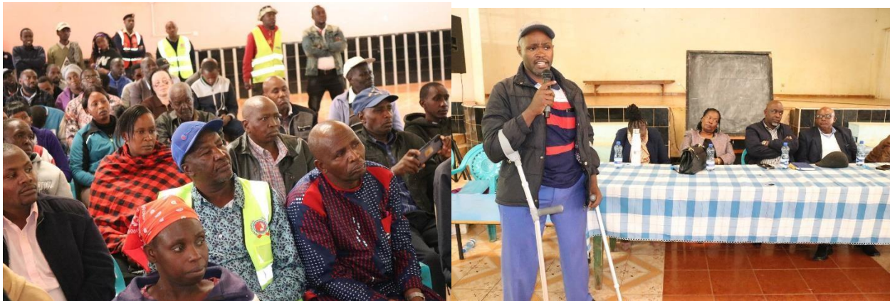
PHOTOS OF PUBLIC PARTICIPATION FORUM KARURI MUNICIPALITY