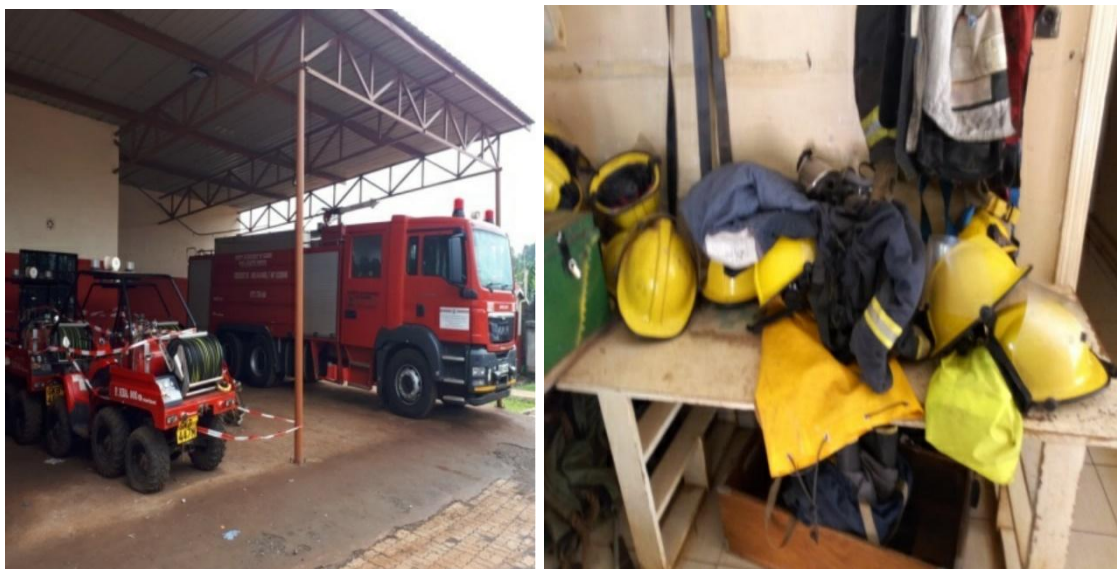
Figure 3: Firefighting Engine and Equipments in Kiambu Fire station.

Other achievements of the fire and rescue department include: reduction of emergency response time, fire safety and audit, training of fire officers and installation of fire hydrants.