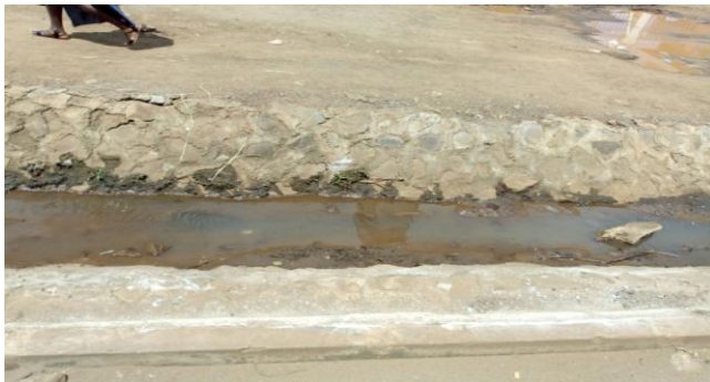
Figure 1: Storm Water Drainage in Kiambu Municipality

In the Fourth schedule, Part 2 of the Constitution of Kenya 2010, the County Government is mandated to provide County public works and services including water and sanitation services, and storm water drainage. Urban storm water management is becoming increasingly important for towns especially in developing countries. The extent of the issue becomes particularly apparent when there is heavy rainfall that floods the settlements situated in the lowest parts of towns and the large number of urban development issues. Storm water is all the water that runs off the land after a rainfall or snowmelt incident. This is a natural process but in urban areas, proper infrastructure needs to be put in place.