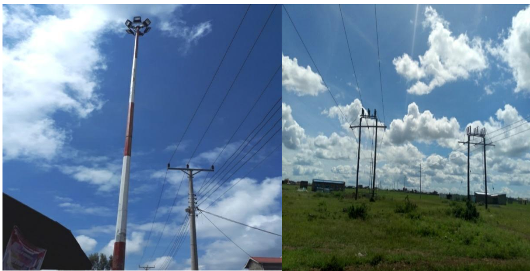
Figure 2: Electricity, Reticulation and Street Lighting in Kiambu Municipality

According to Kenya Power 2023 report, Kiambu county had electricity coverage of 66 percent. The total number of households connected to electricity within the proposed municipality is 70 percent and this number is expected to rise to 100 percent by the year 2022. Solar energy has less than 5percent coverage, while Biogas use is at 25percent especially by farmers practicing urban agriculture within the municipality.