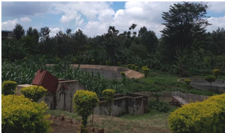
Figure 4: Kiambu Sewerage Treatment Works