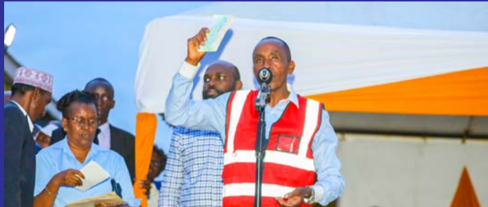
Kiambu Governor Kimani Wamatangi during the disbursement of bursary cheques to beneficiaries of the scholarship programs at Kalimoni Ward in Juja Sub-County.