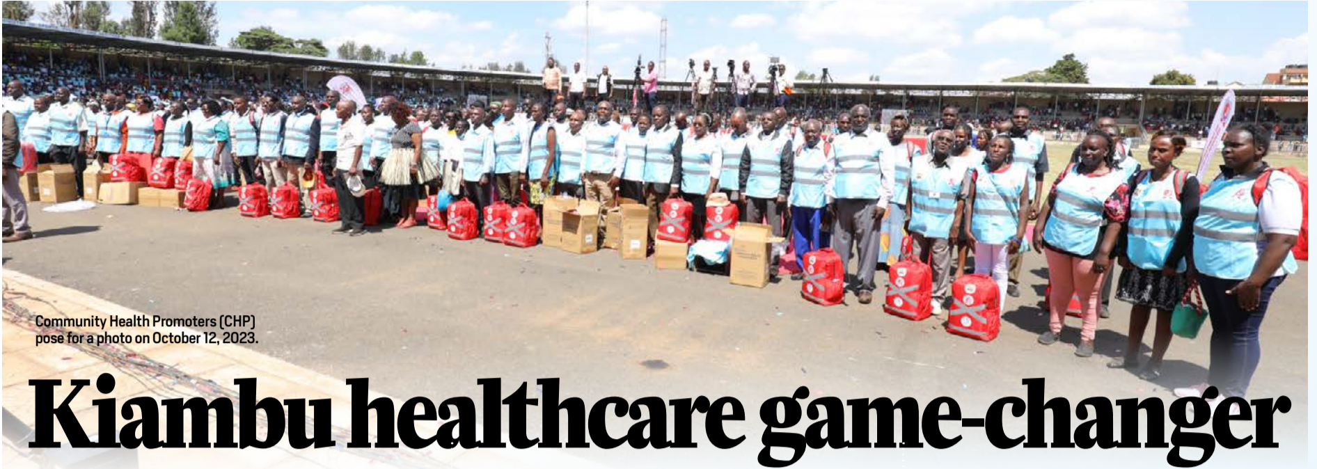
Community Health Promoters (CHP) pose for a photo on October 12, 2023.