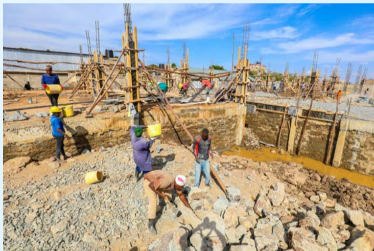
Ongoing work at the new Juja Level Four Hospital in Juja Ward, Juja Sub-County.