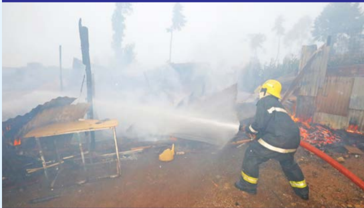
Firefighters from Kiambu County Government fight a fire that razed down a trader's shop in Limuru Sub-County.

The County Fire Training School, a joint venture between the County and the Polish Centre for International Aid, has successfully trained 700 firefighters from different counties. The Fire and Rescue team persistently engages in raising awareness about Community Fire Safety in educational institutions and public barazas.