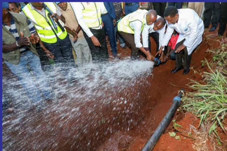
H.E. Dr. Kimani Wamatangi and Ngewa MCA Hon. Charles Kang'ethe commissioned Mitahato Water Project in Ngewa Ward, Githunguri Sub-County.

In an effort to enhance water supply, Governor Kimani Wamatangi has collaborated with the national government to secure Ksh 5.7 billion for expanding the ca-