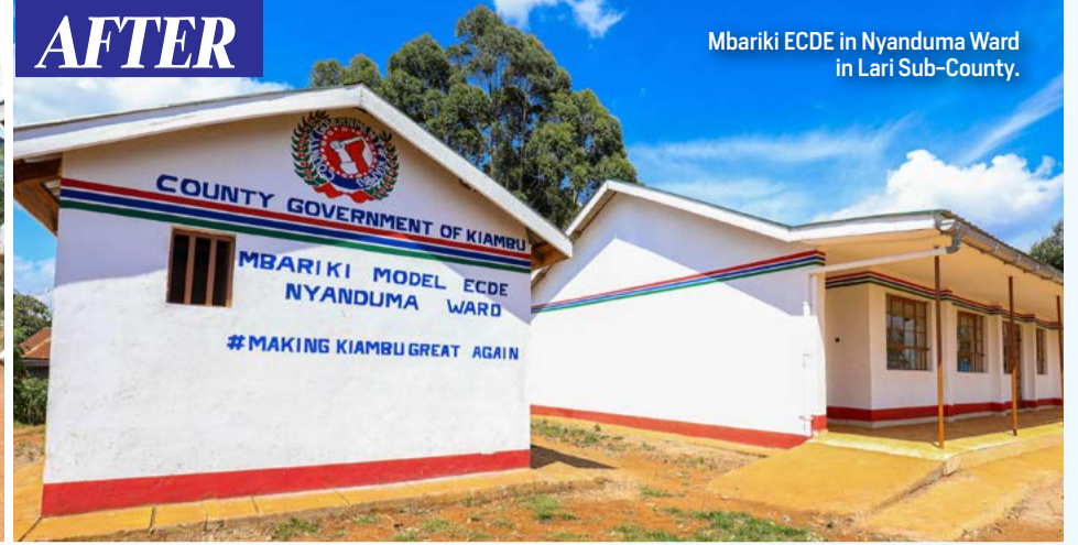
Mbariki ECDE in Nyanduma Ward in Lari Sub-County.