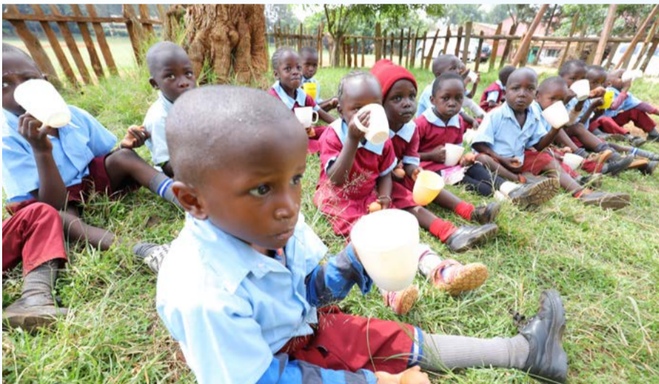
Learners at Kasarini Primary School ECDE centre in Kiambu Township ward enjoy a cup of uji and a boiled egg. The county government of Kiambu has been feeding all the 36, 000 ECDE learners in 534 centres across the county with a bowl of uji daily and boiled eggs three times a