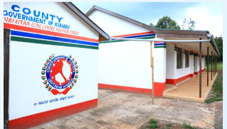
Wamitaa ECDE in Ngenda Gatundu South.