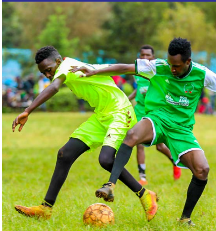
A Githunguri Snr player shields the ball from a determined White Rose player during the finals of the Githunguri Sub-County level match on Saturday, December 16th, 2023, at Ngewa Stadium, Githunguri Snr emerged victorious with a convincing 5-1 scoreline against White Rose FC.