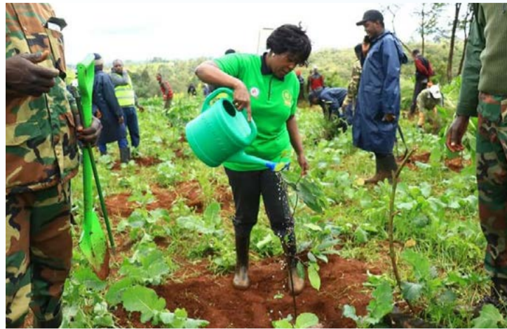
Deputy Governor Rosemary Kirika plants a tree in Nyamweru Compartment Thogoyo, Upland Forest during the National Tree Growing Day.