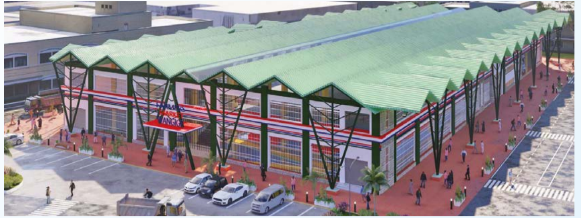
Design for Wangige Market.