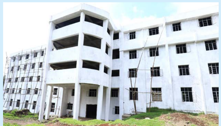
Lari Level Four Hospital