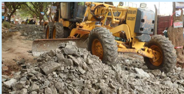
Works at Maziwa-Kiamumbi-Kiu Kenda Road which links the Kiamumbi area and Kiambu-Ruiru Road.

T he department of Roads, Transport, Public Works and Utilities continues to improve public infrastructure and utilities in Kiambu.