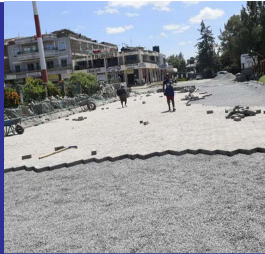
Cabro paving works around Felma Park in Kahawa Sukari.