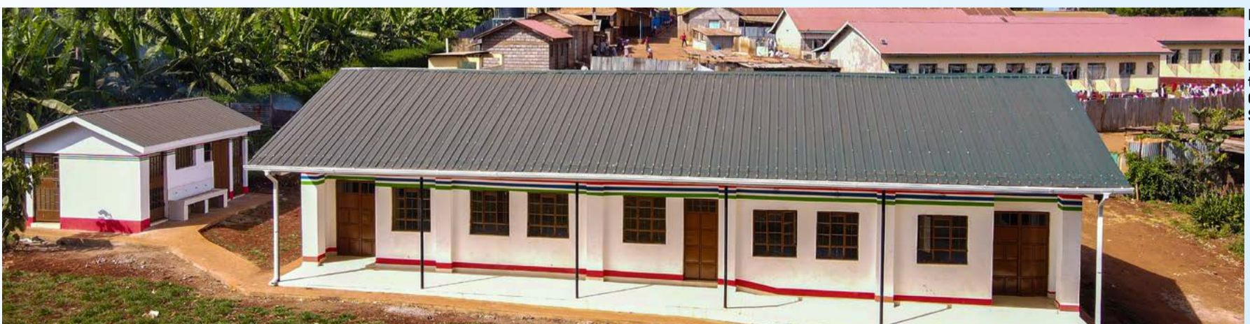
Kagema Primary School model ECDE in Komo-thai Ward, Githunguri Sub-County.