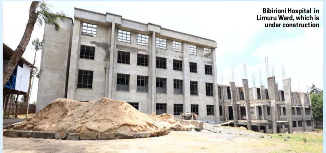
Bibirioni Hospital in Limuru Ward, which is under construction