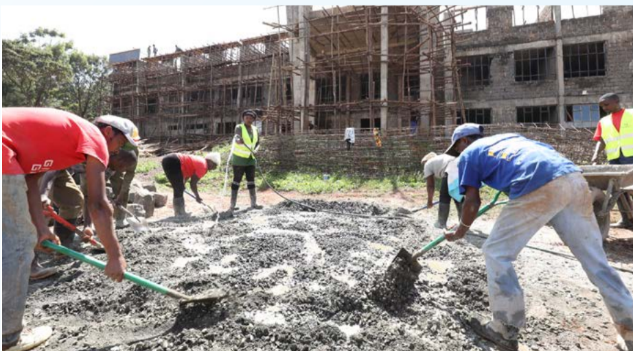
Ongoing works of the construction of Thogoto Level 4 Hospital.