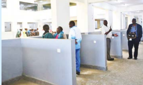
Traders being allocated space at Githurai Market.