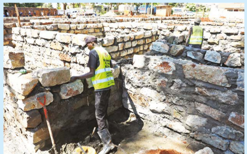
Ongoing construction Ndumberi Level Three Hospital in Ndumberi Ward.