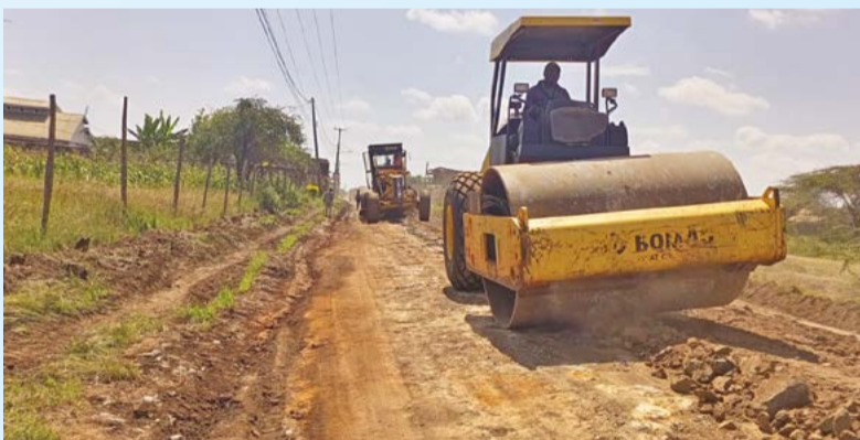
Gravelling of a section of Juja Farm Juja house main road.