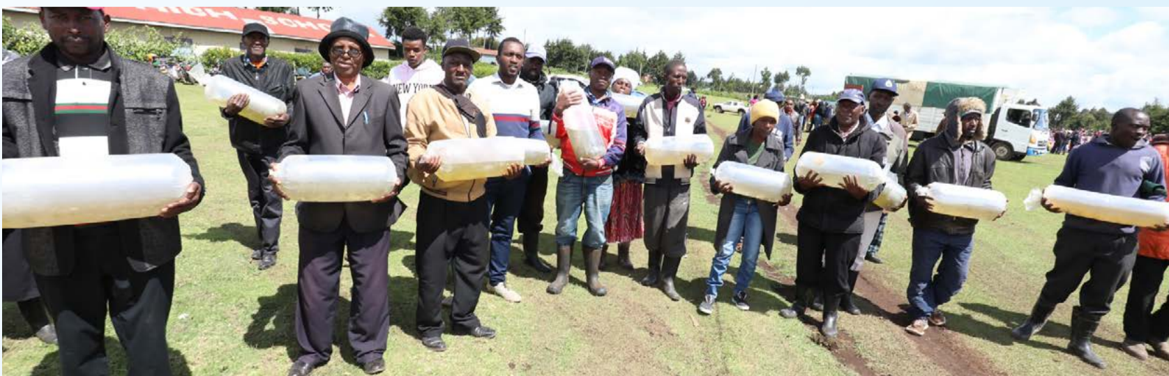
Distribution of fingerlings to local farmers engaging in fish farming in Kinaale area, Lari Sub-County.