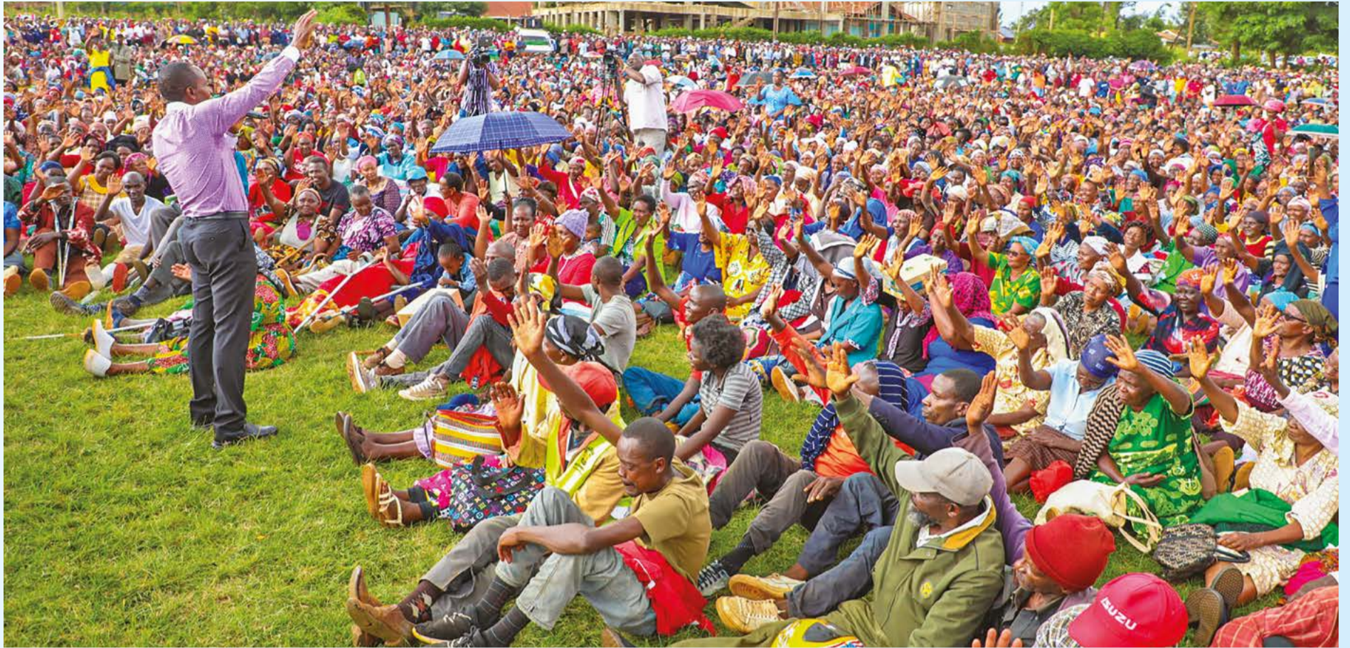
Governor Kimani Wamatangi acknowledge greeting from people in Ngewa Ward in Githunguri Sub County where the county government distributed maize seeds and fertilizer and chicks to over 9,000 farmers.