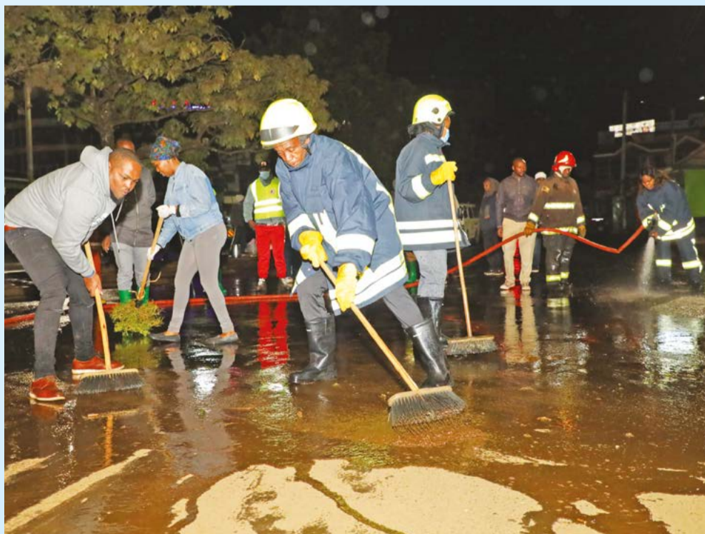
H.E Dr Kimani Wamatangi during a clean up exercise in Limuru Town on July 29, 2023.