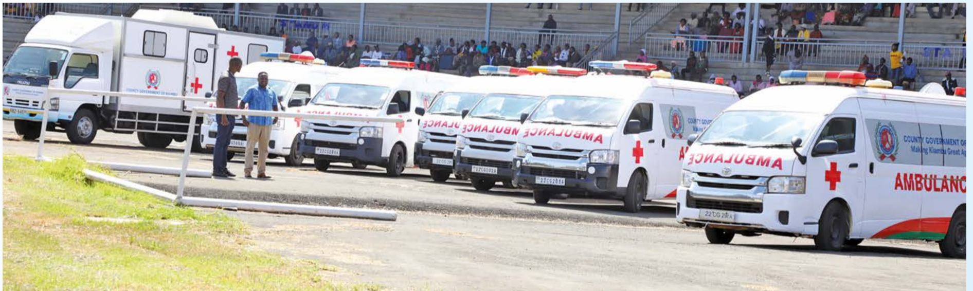
Kiambu County has rehabilitated over ten ambulances and is acquiring six new ones to boost the healthcare system.

Stalled projects are back on track in Tigoni, Bibirioni, Wangige, Lari, and Thogoto hospitals, with contractors dedicated to completing them," he remarked