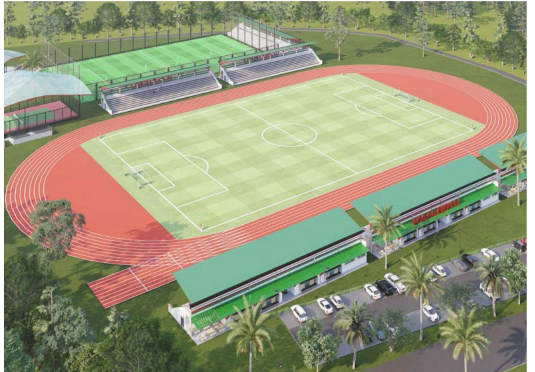
Design for Kanjeru Stadium in Kabete

Butterfly FC 3 - 0 Tumaini FC COPIA FC 10 - 0 Black Wolves FC