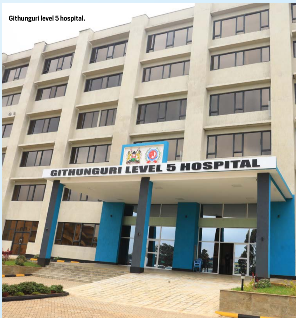
Githunguri level 5 hospital.