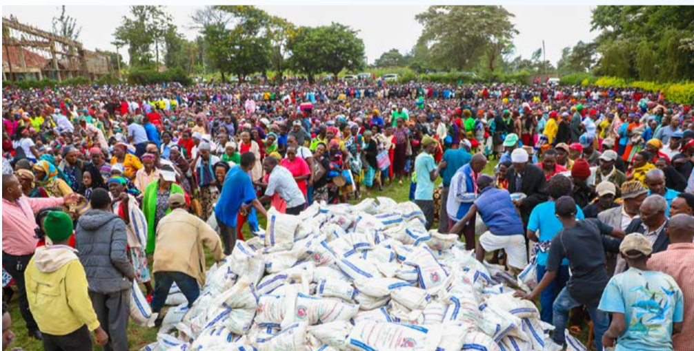
Chicks, Maize Seeds and Fertilizer, Bursary Cheques Distribution in Ngewa Ward on January 5, 2024.

In the domain of Youth Affairs and Sports, Kiambu County is rehabilitating and enhancing various sports facilities, including Thika Stadium, Kawaida Sports Ground, Kanjeru Stadium, Ruiru Stadium and Gikambura Super 99.