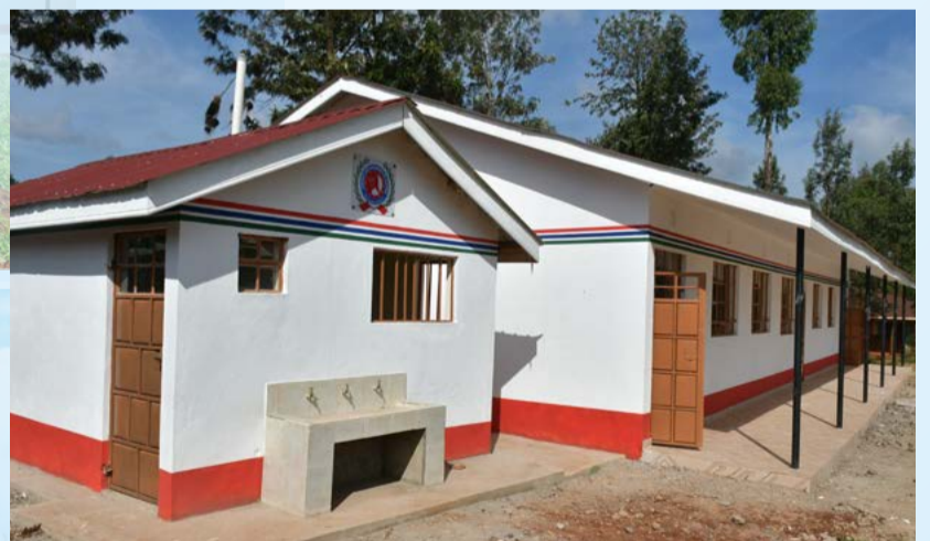
Mutuma ECDE centre in Mang'u Ward, Gatundu North Sub-County.