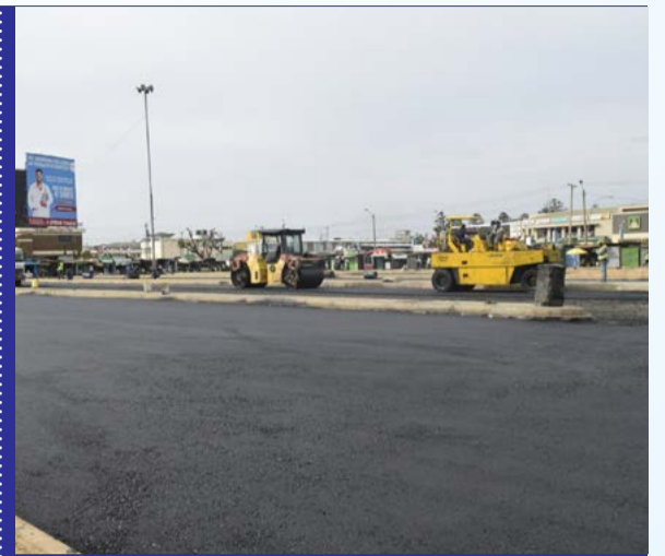
Tarmacking of Makongeni Bus Park in Thika Town.