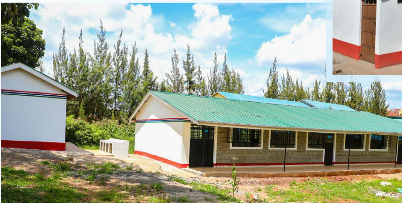
Kasarini Primary School model ECDE centre in Kiambu Township Ward.