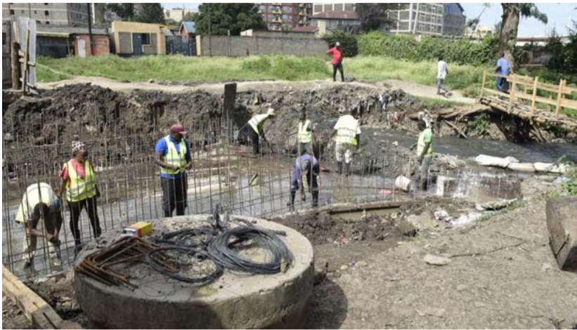
Ongoing construction of a double celled bridge which connects Kiuu and Kahawa Weni-dani wards at Bosnia Kiuu River.