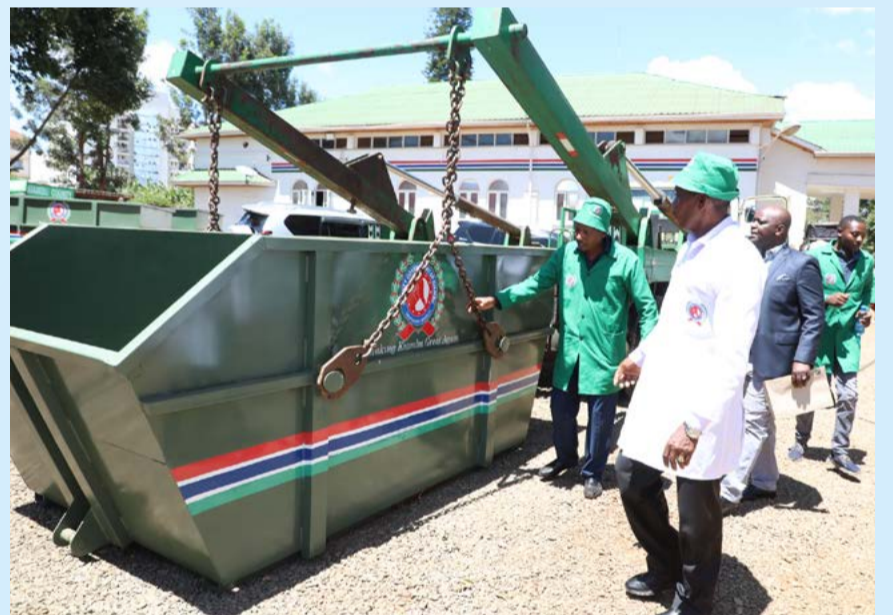
Kiambu Governor Kimani Wamatangi and CECM for Environment David Kuria during the launch of the distribution of litter bins across all the sub-counties. These litter containers, including skips, single bins, and triple bins for waste segregation, signify our commitment to responsible waste management in Kiambu.