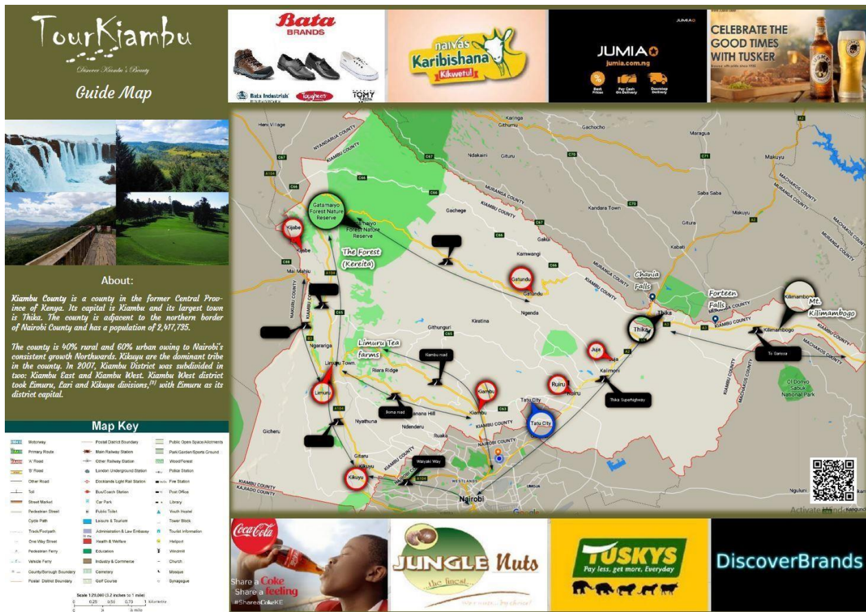
County Map Side