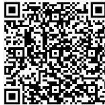
QR code example

The map QR will be directly linked to the TourKiambu which will take you straight to the corresponding municipality being searched. This is an embedded QR code/link that the map users can use through their gadgets for further online assistance. E.g. site history, hotels and their capacities, farmers markets, industries, emergency services, photo and videos galleries' and online Google maps directions.